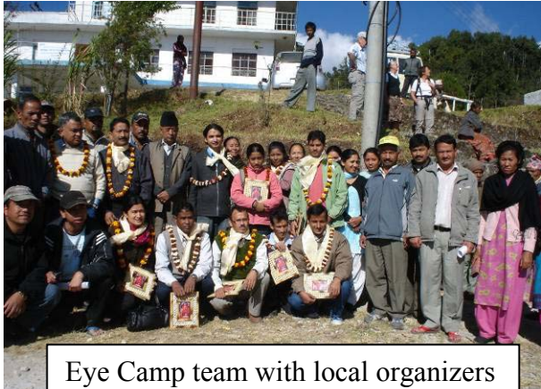
Eye Camp team with local organizers